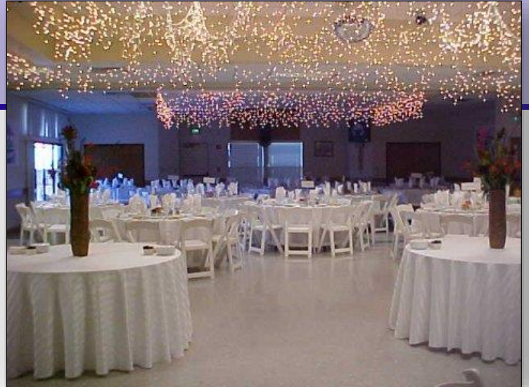
Room 2 and 3 decorated for a wedding