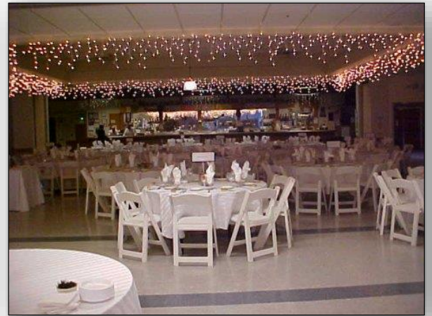
Bar/Lounge combined with Room 1