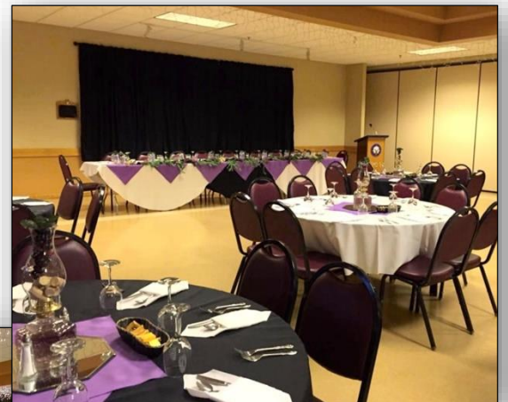
Rooms 1 & 2