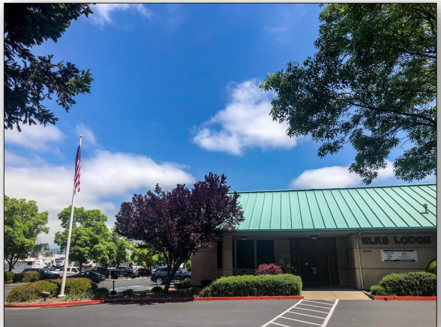
Front entrance and off-street parking