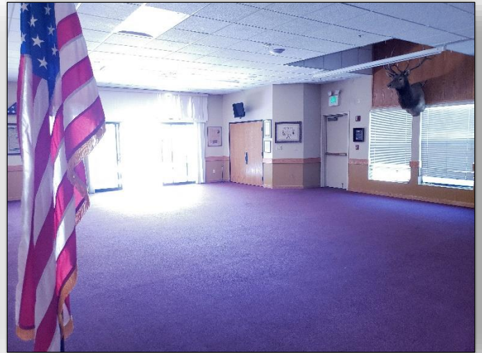
Room 3 with afternoon light from Patio area

This carpeted back room has windows for natural light, and works well for presentations, business meetings, and meals for small groups. Room 3 connects directly with the Patio, and can be fully opened to combine with Room 2.