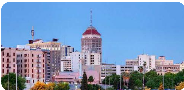
CHEA Convention 2024: May 15th – 18th Clovis/Fresno

Elks Lodges set aside May 1-7 as Elks National Youth Week. All Lodges are urged by the GER to sponsor programs throughout this week dedicated to the youth of our country.